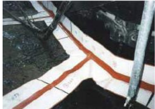
RedLINE 40G installed for a hydrostatic application.

RedLINE 40G can withstand 134ft [41 m] head of water while sustaining an expansion of 2" [50 mm].