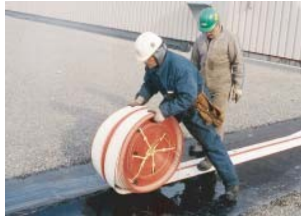
RedLINE 40 being installed in BUR.