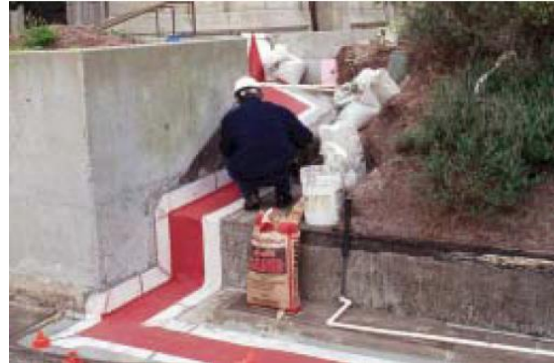
RedLINE 240 being installed.