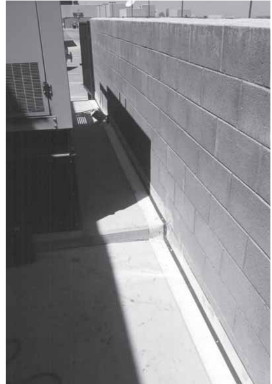
▲ The epoxy resin is applied on to the substrate with a bolt cartridge gun and the FlamLINE is laid into the bed of epoxy. The top surface of the yellow flange is similarly coated.