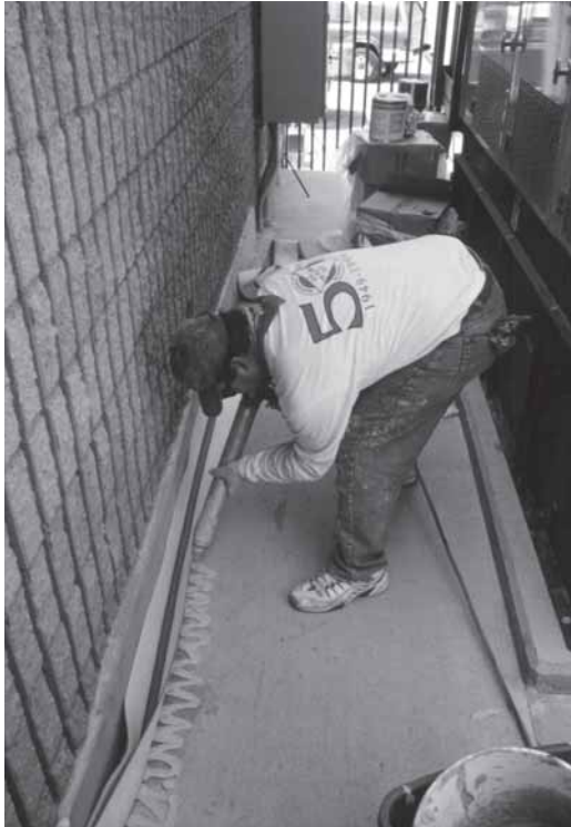
▲ The FlamLINE adhered with epoxy to the substrate.