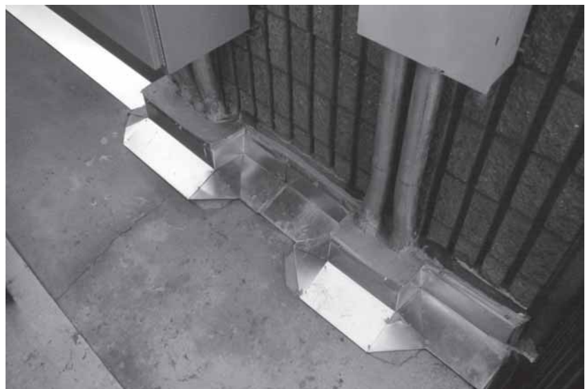
The completed FlamLINE installation with a protective metal flashing in place.